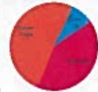
Incentives by Measure