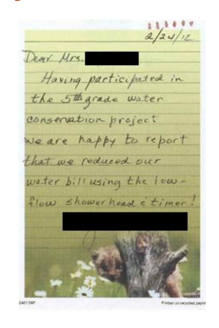
Figure 3-1. Positive Parent Feedback