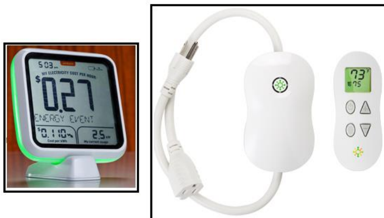
Figure 3-3 Smart Grid Technologies – Energy Joule and SmartAC Adapter

In EPY7/GPY4, the Efficient Living Program is plans to pursue activities that would strengthen its partnership with the DCEO Trade Ally Network. Staff indicated that contractors could benefit from more formal communication and education about the Efficient Living Program and the nuances of working with PHAs. Timing of funds continues to be an issue for contractors. Most PHAs have to wait for grant funds to be released before they are able to pay contractors, which can be challenging for both PHA staff. For projects that exceed a budgetary benchmark there are certain procurement rules that PHAs have to follow and that contractors need to understand prior to beginning work. Staff indicated that the DCEO Trade Ally Network could be a valuable delivery mechanism for an Efficient Living Program training module that could address these challenges.