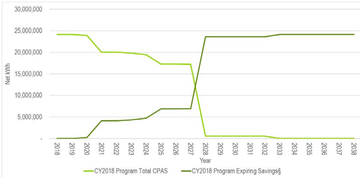
Figure 4-1. Cumulative Persisting Annual Savings

‡ Expiring savings are equal to CPAS Yn-1 - CPAS Yn + Expiring Savings Yn-1.