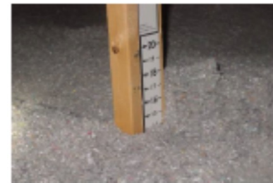
Figure 21331-2: Attic insulation marker

Current Home Energy Savings (joint ComEd/PGL/Nicor program) practice: Unless home has insulation levels below R-19, the utilities walk away from improving building envelope.