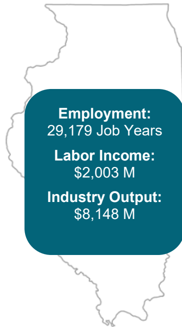
Figure 3: Estimate of Cumulative Economic Impacts (2024-2048)

Source: Guidehouse analysis of ComEd CY2024 Data