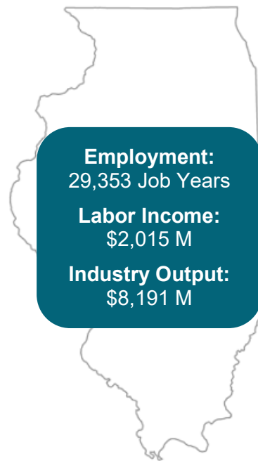
Figure 3: Estimate of Cumulative Economic Impacts (2024-2048)

Source: Guidehouse analysis of ComEd CY2024 Data